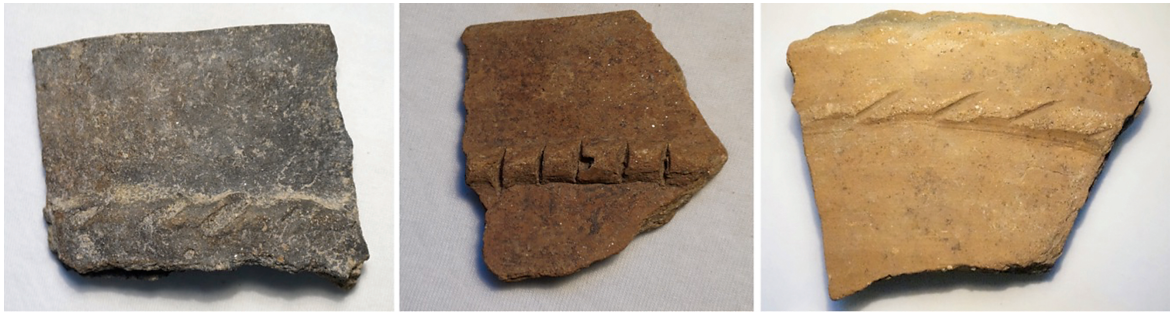
Pl. 1/1: Emporion Pistiros sherds representing the color scale, from left to right – Grey, Red Brown, and Yellow Brown.