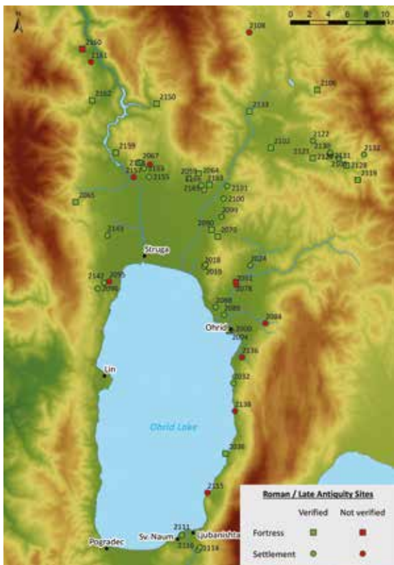
Pl. 1/6: Habitation pattern in the Roman period and Late Antiquity (map by M. Jančovič).