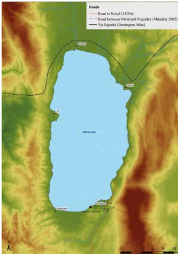
Pl. 1/5: Map of the communication network in the region and pathway model to the Korçë plain (map by M. Jančovič).