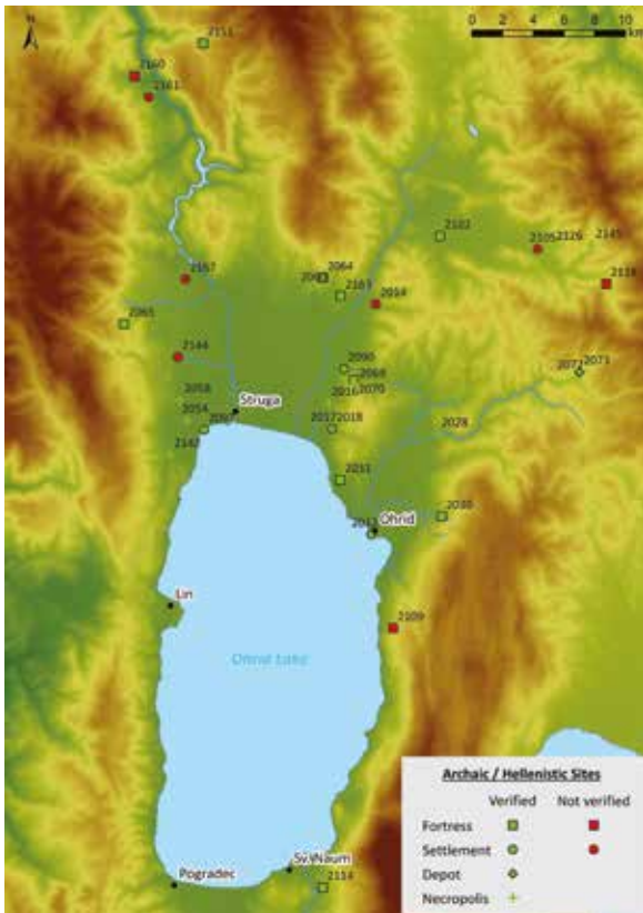
Pl. 1/3: Habitation pattern in the Archaic, Classical and Hellenistic period (map by M. Jančovič).