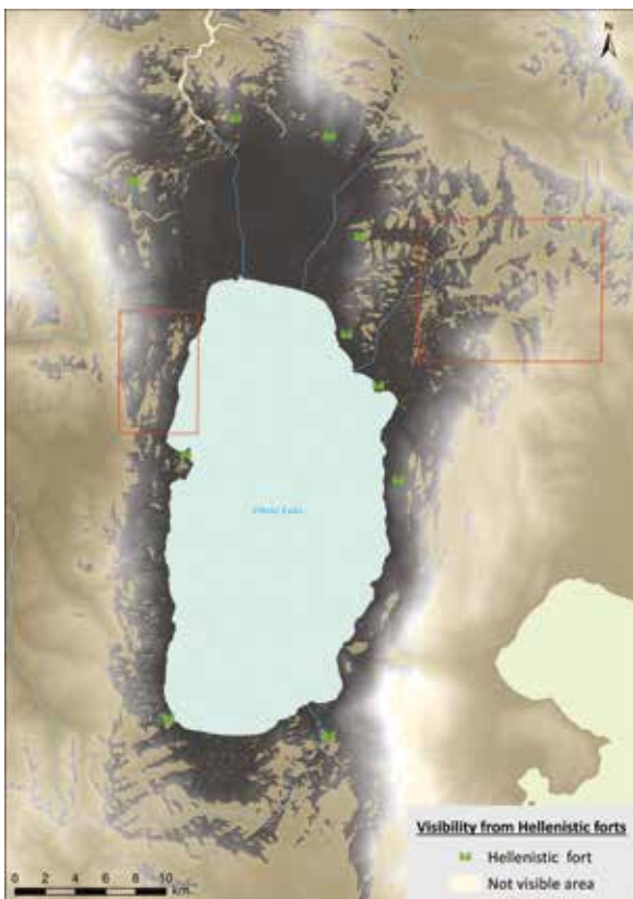
Pl. 1/4: Model of visual communication between Hellenistic hill-top forts (map by M. Jančovič).